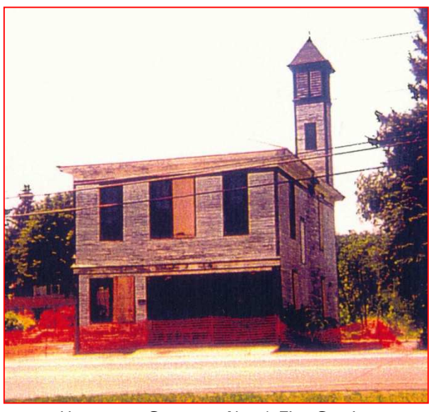
Huguenot Steamer No. 1 Fire Station Main Street, North Oxford MA (circa 1999)

Since its original construction, the Station has undergone very few changes, mostly associate to the introduction of motorized apparatus in the 1920's. These changes included the addition of roll-up doors for the apparatus bays, and a partitioning of the interior space on the first floor for insurance purposes. The station served the Oxford Fire Department and residents of North Oxford until 1975, at which time a new station was constructed across the street.