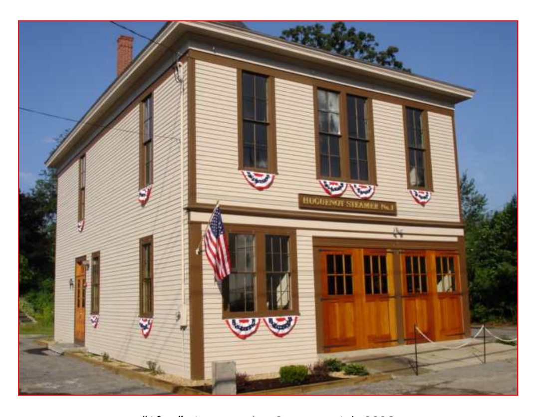
"After": Inauguration Ceremony July 2006