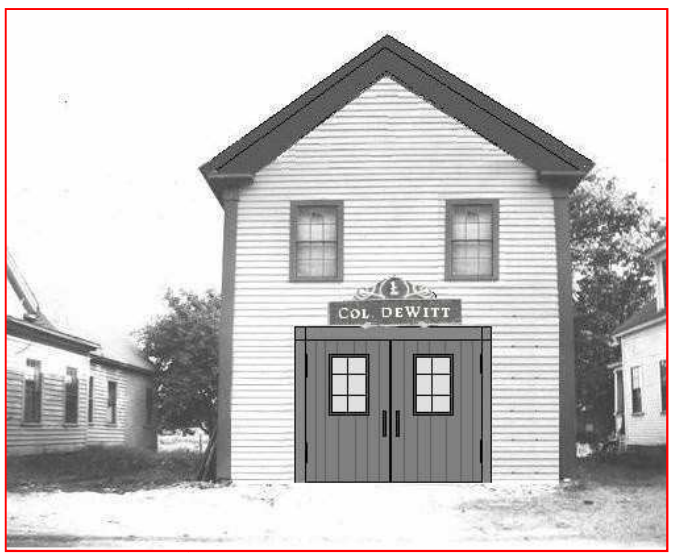
Colonel DeWitt Hose Company Barton Street, Oxford MA (retouched to approximate original configuration)

For many years the Town of Oxford was protected by this one fire company which utilized an 1857 Jeffers Hand Tub (named the Colonel DeWitt) and a 300' hose reel as the sole means of fire protection for the entire town. Originally the hand tub fire engine was stored outside on the town common, however it was eventually relocated to the newly constructed "fire barn" on the land donated by the DeWitt family.