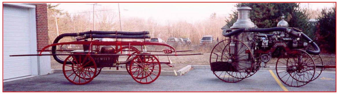
Colonel Dewitt Hand Tub (1857 Jeffers) and Huguenot Steamer (1884 Silsby) The first two fire engines owned and operated by the Town of Oxford Fire Department 2002 Photo

In the late 1800's, as Oxford continued to grow and more industry came to town, it was decided to establish a second fire company in the north section of town to provide protection to the residents and the growing number of mills that had been established there. Accordingly, in 1884, the town appropriated money to purchase a Silsby Steamer, 5th size, and constructed a fire station to house it. Known as the Huguenot Steamer No. 1 (named after the French Huguenots who had originally settled Oxford), this fire company served proudly for many years with Silsby Steamer No. 767 in their charge.