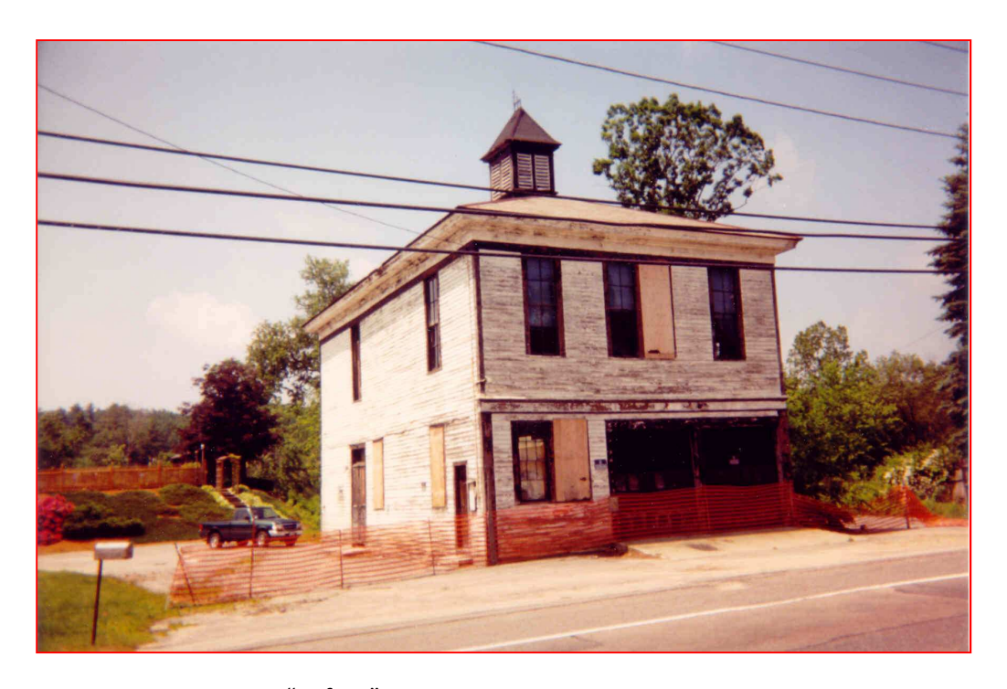
"Before": Huguenot Steamer No. 1 circa 1999