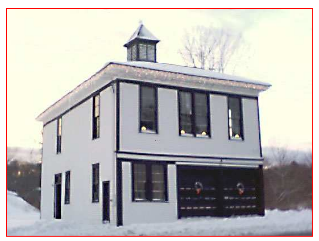
Huguenot Steamer No. 1 Fire Station Phase I Stabilization "Dressed for the Holidays 2002"

Since taking ownership, the Association has secured registration for the Huguenot Steamer No. 1 Fire Station as one of the Ten Most Endangered Historical Resources in the Commonwealth of Massachusetts. Additionally, the Association has also secured several grants which, along with private donations, have allowed restoration to proceed on schedule.